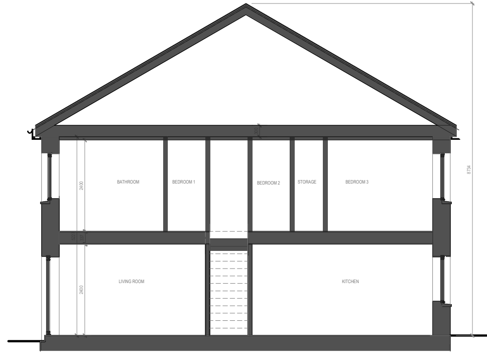
SECTION AA 3 BEDROOM