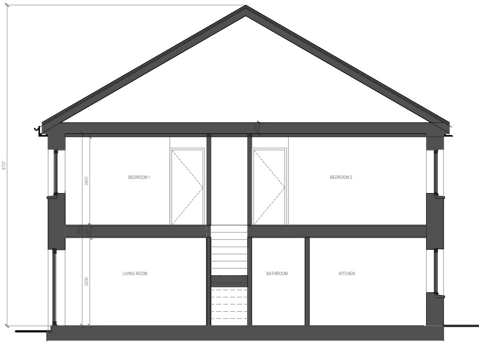
SECTION AA 3 BEDROOM ALTERNATIVE

GENERAL NOTES © O'CONNELL MAHON ARCHITECTS • DO NOT SCALE. USE FIGURED DIMENSIONS ONLY. • THIS DRAWING IS TO BE READ IN CONJUNCTION WITH ALL RELEVANT SPECIFICATIONS AND DRAWINGS. • ALL DIMENSIONS TO BE CHECKED ON SITE. • IN THE EVENT OF ANY DISCREPANCIES BETWEEN DRAWINGS, THE CONTRACTOR IS TO INFORM THE ARCHITECT IMMEDIATELY.